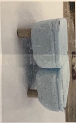
Leather cushioning on a wooden plate - Bolted to interior frame

Holes would be drilled in to the bottom, then bolted frame into an interior frame.