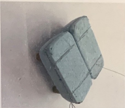
Scamsin the leather